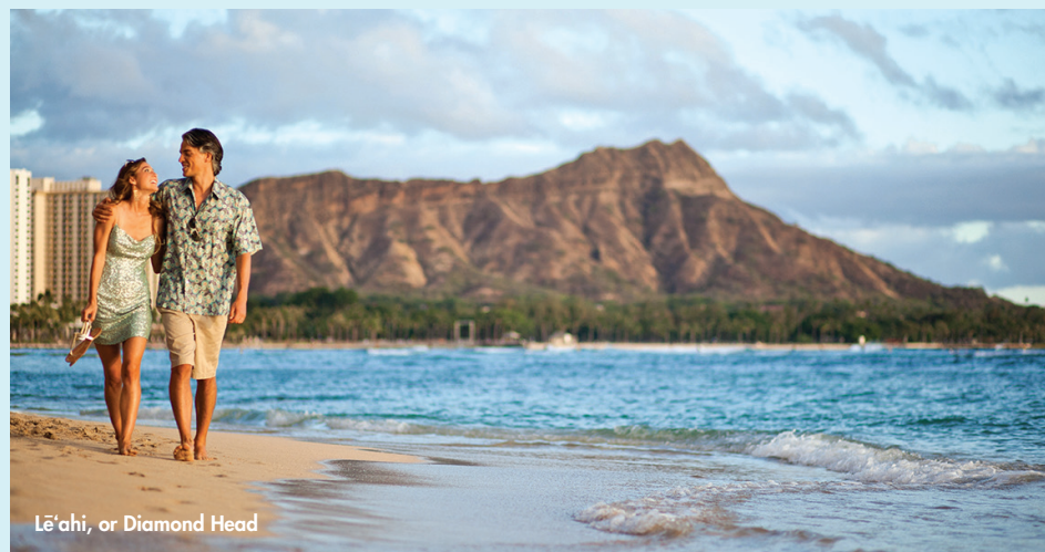
Lē'ahi, or Diamond Head

Gain perspective on O'ahu's geology and geography, grab your hiking shoes and take an early morning hike to the top of Lē'ahi, or Diamond Head—a 760-foot extinct volcanic tuff cone and National Landmark. Once at the top, you'll enjoy a panoramic view that extends along O'ahu's south shore.